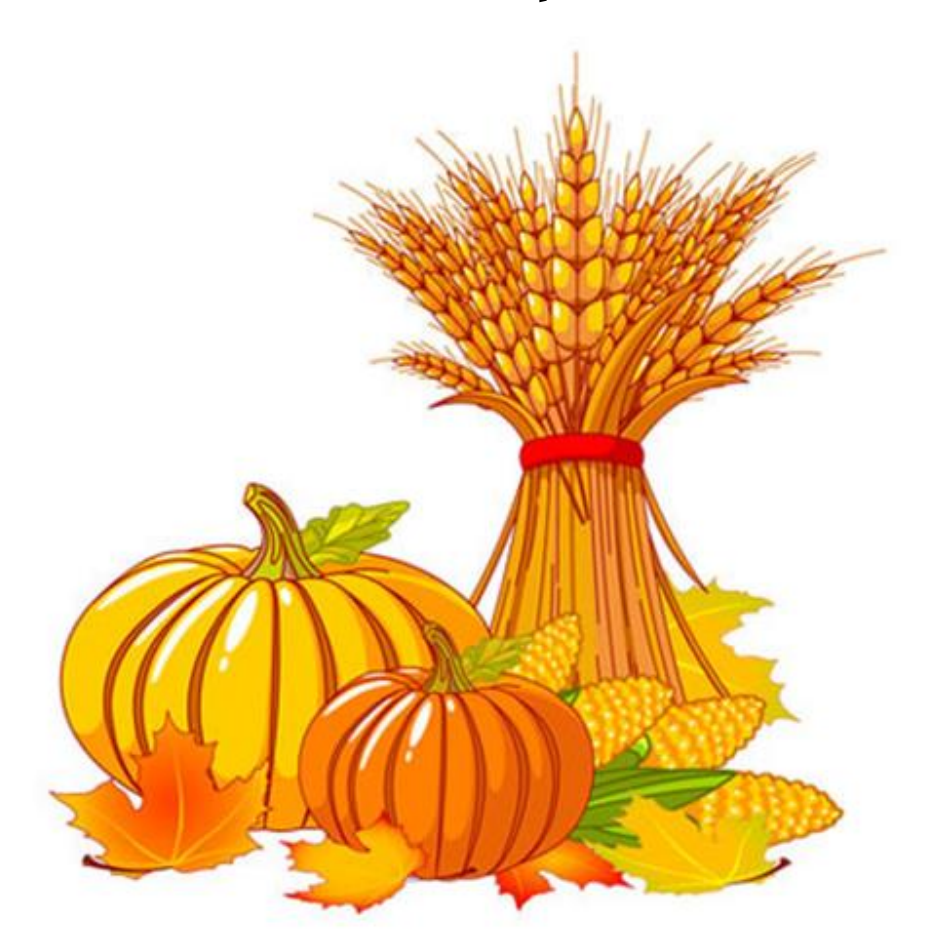
The 26<sup>th</sup> Sunday after Pentecost