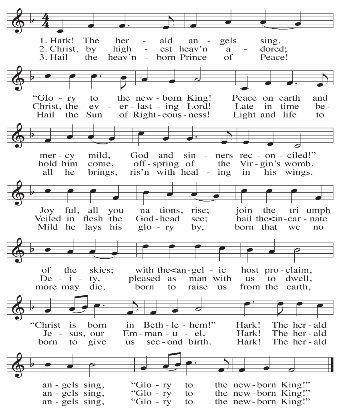
Setting published 1982 by GIA Publications, Inc. • All rights reserved