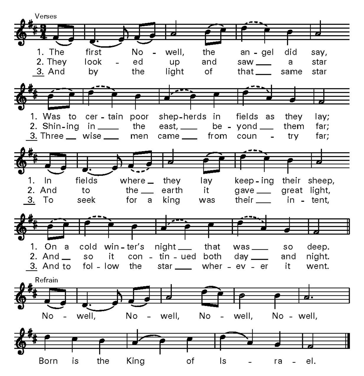
Text: Irregular with refrain; trad. English Carol, 17th cent.; verse 6, alt. Music: Trad. English Carol, 17th cent.