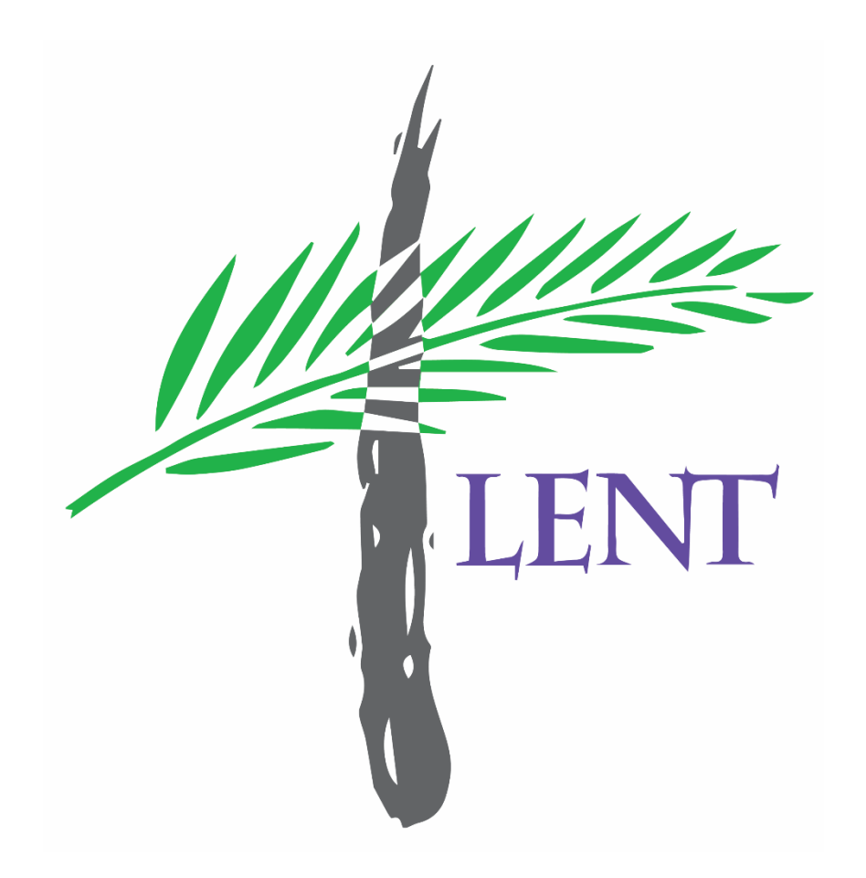
The Fourth Sunday in Lent